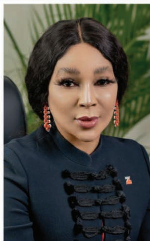
Dame Dr. Adaora Umeoji, GMD/CEO, Zenith Bank PLC

SINCE its establishment, the University of Calabar (fondly referred to as UNICAL), has carved a niche for itself as a foremost institution in Nigeria. UNICAL has lived up to the purpose for which it was established to “be a world-class